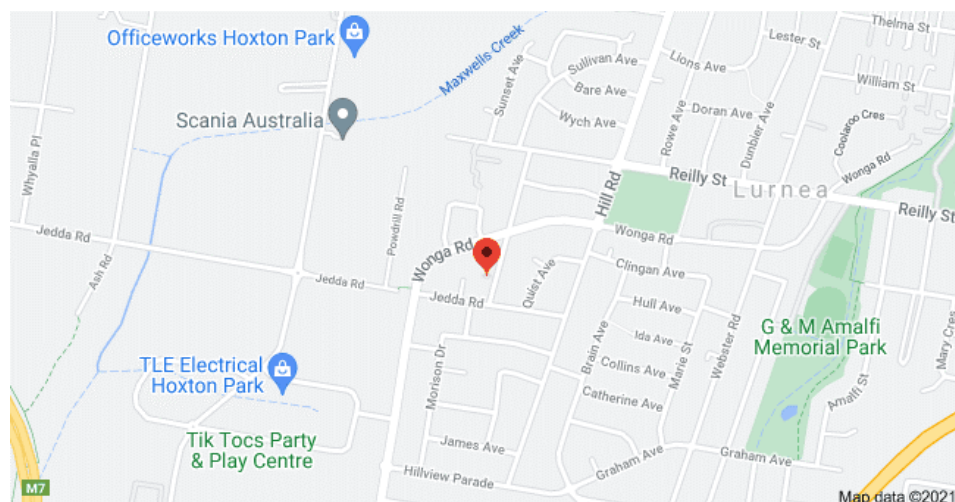
Figure 1: The location of the subject site.